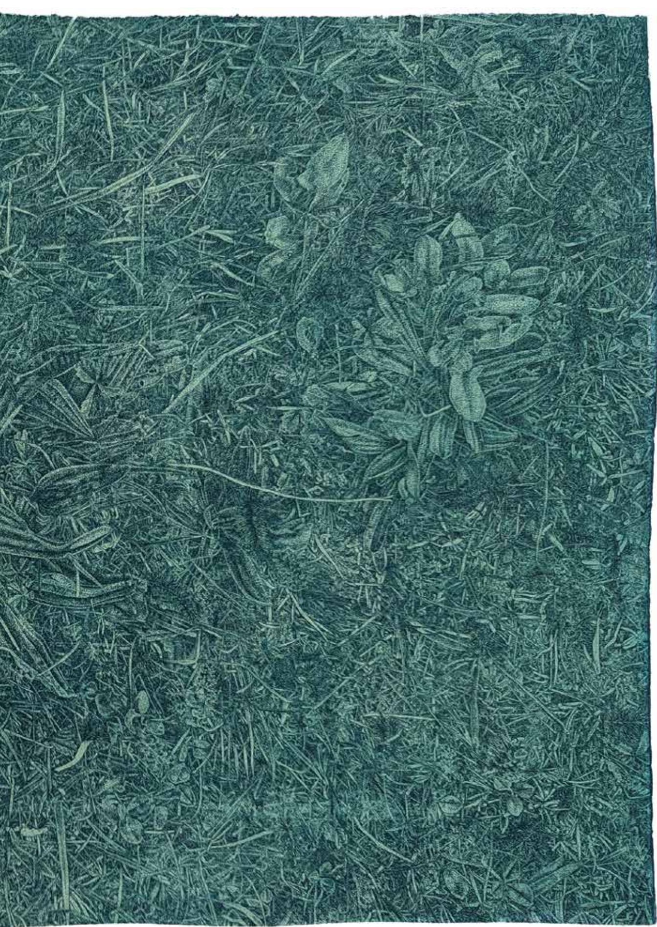
Figure 6. Ford panel IV, 40x60cm, Etching, 2023