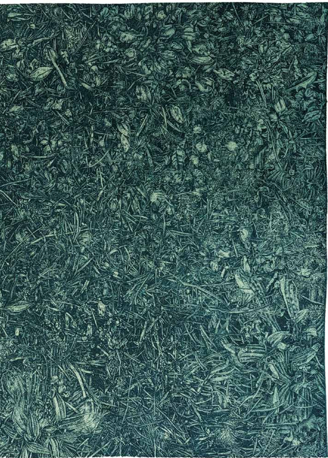
Figure 3. Ford panel I, 40x60cm, Etching, 2021