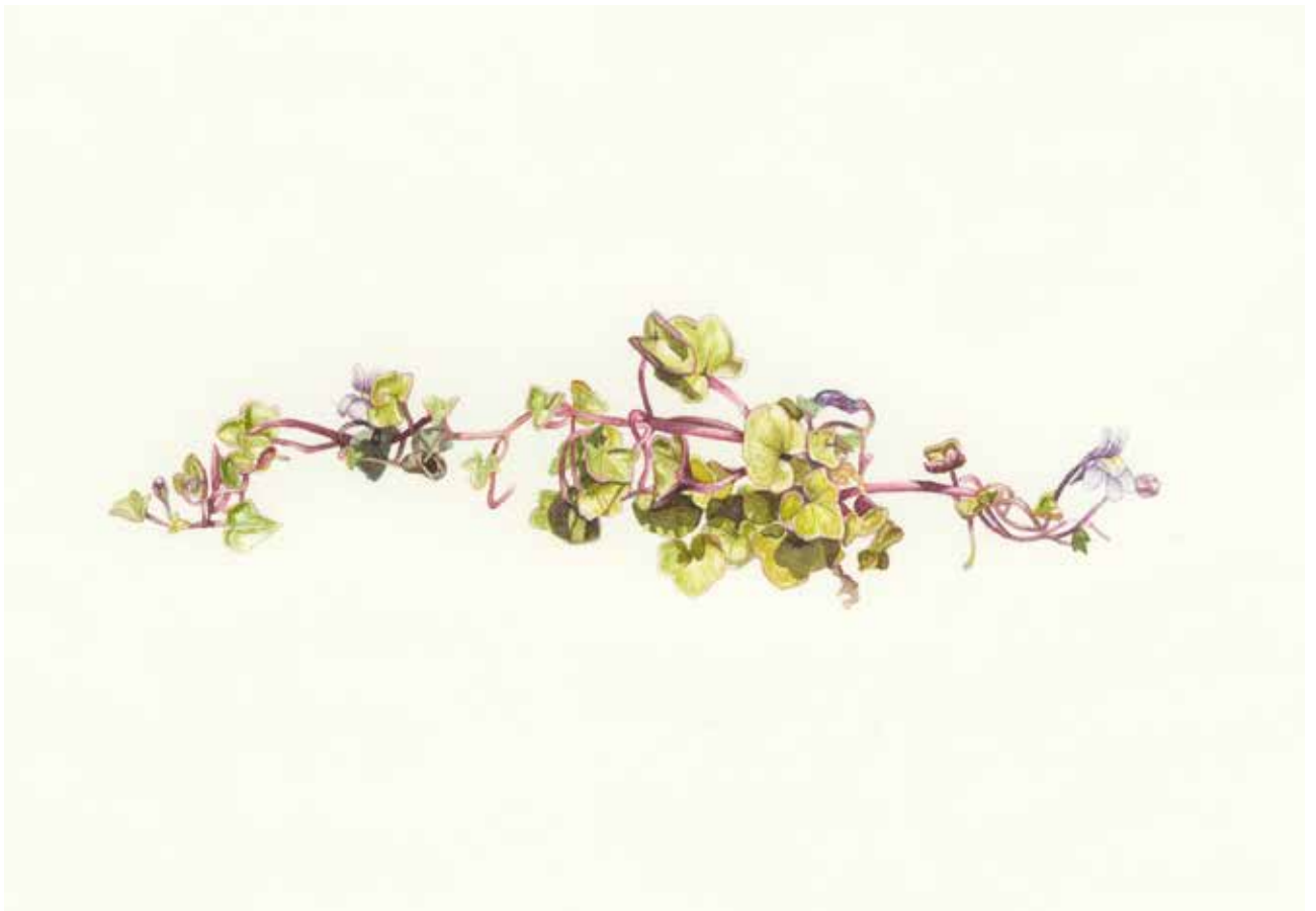
Figure 2. Ivy Leaved Toadflax, 21x15cm, watercolour, 2020.