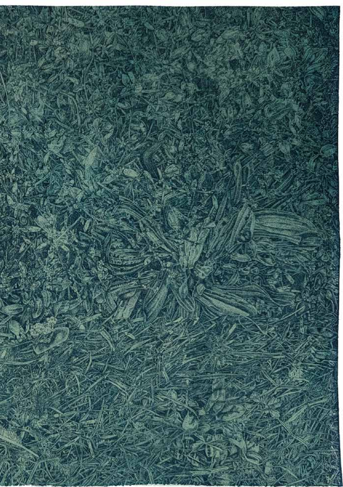
Figure 5. Ford panel III, 40x60cm, Etching, 2023