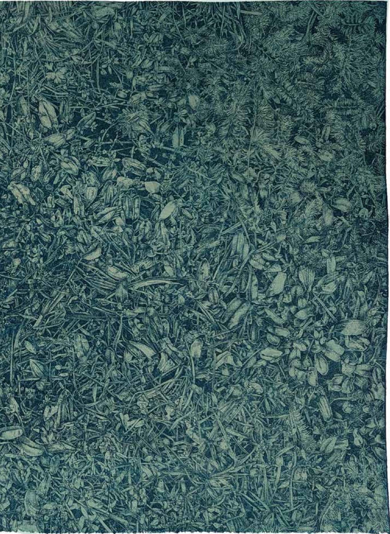
Figure 4. Ford panel II, 40x60cm, Etching, 2022